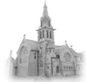
St. Brigid's, Ardagh