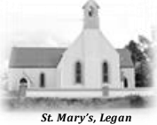
St. Mary's, Legan