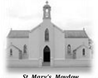
St. Mary's, Moydow